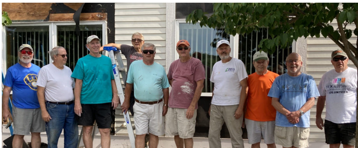
Group of church members lending their skills to replace exterior casing trim on our Church

Then, comment and share our posts! For more information: e-mail: preschool@economowocucc.org